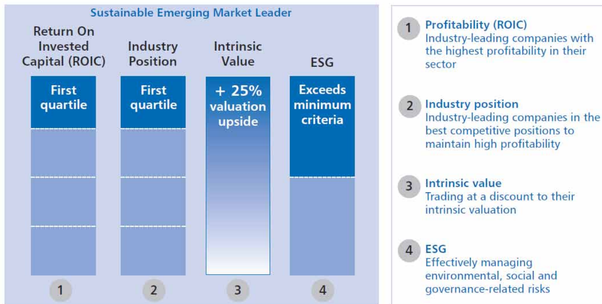
Figure 1, The four pillars of the investment process